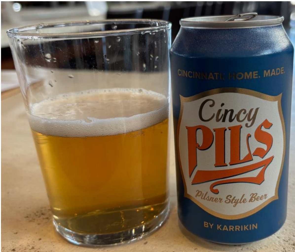
Karrikin Cincy Pils 5.2% ABV

I had a chance yesterday to enjoy the new reformulated version of Karrikin Cincy Pils. This is a great example of Pilsner Style.