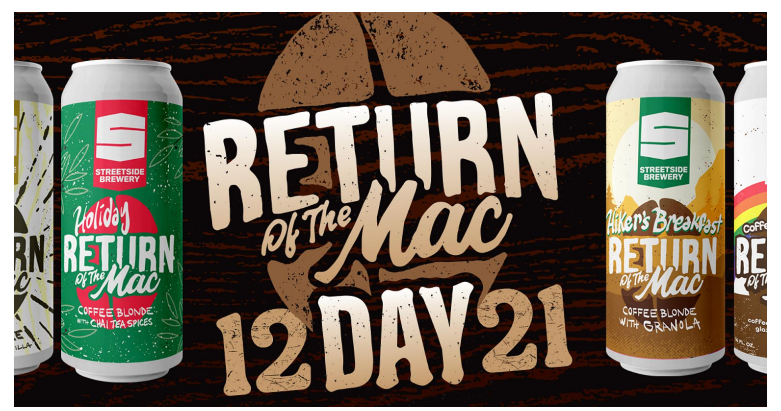
Coffee Blonde Ale 5.5% ABV

Dripping in aromatics of coconut, honey, and fresh vanilla blended together in a fresh cup of your favorite morning coffee, this coffee blonde showcases the best of beer and coffee with a silky body and luscious caramel creme flavors. Undercurrents of coconut cream pie and toasted pie crust this 5% banger is not to be trifled with.