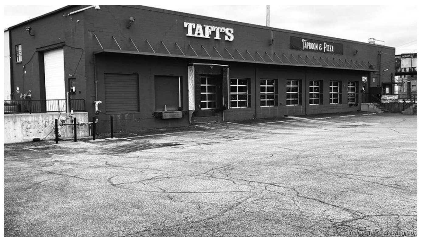
Impact Beverage, a contract beverage manufacturer serving some of the most prominent and fastest-growing brands, expects to double its workforce and increase its footprint in the city of Cincinnati. The company is currently located in the former Taft Brewpourium space in Spring Grove Village. By Brian Planalp – Staff reporter, Cincinnati Business Courier Dec 17, 2024