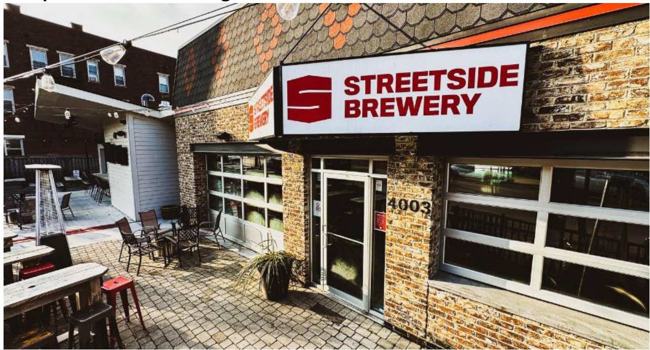
4003 Eastern Ave, Cincinnati, OH 45226

Dripping in aromatics of coconut, honey, and fresh vanilla blended together in a fresh cup of your favorite morning coffee, this coffee blonde showcases the best of beer and coffee with a silky body and luscious caramel creme flavors. Undercurrents of coconut cream pie and toasted pie crust this 5% banger is not to be trifled with.