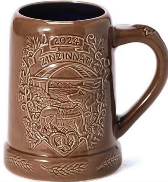
The official Oktoberfest Zinzinnati 2024 beer stein