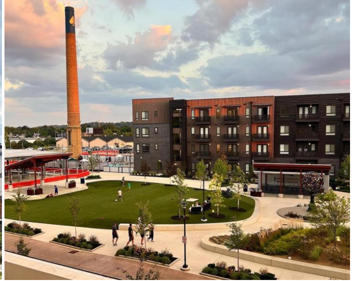
Factory 52

The beer will be flowing at Factory 52's newest event this summer. The mixed-use development in Norwood announced it is launching 52 Taps, a new beer festival happening Saturday-Sunday, July 20-21. 52 Taps will showcase Cincinnati's craft beer scene with a selection of 52 unique beers from both local and regional breweries. Beers offered at 52 Taps will cover a range of styles, including IPAs, lagers, sours and barrel-aged brews. "Whether you're a seasoned beer connoisseur or just starting to explore the world of craft beers, 52 Taps has something to tantalize your taste buds. Discover hidden gems from up-and-coming breweries and find your new favorite pint alongside fellow beer lovers," Factory 52 said in a press release.