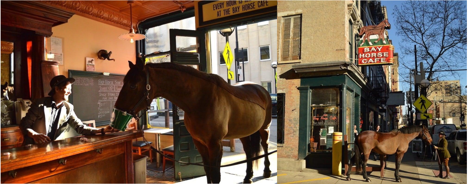
Wilden the Cleveland Bay was the soon-to-reopen Bay Horse Cafe's first official customer.