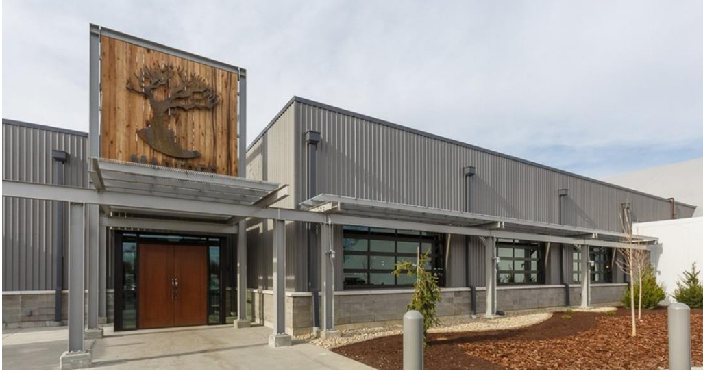
MadTree Brewing in Oakley