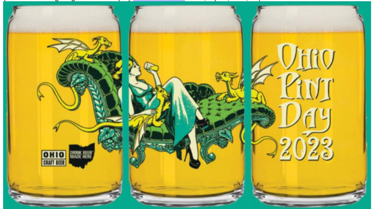
Collectible pint glass for Ohio Pint Day

Breweries will have different offerings on Ohio Pint Day, with some selling the glass with the customer's choice of beer and others including the glass with a crowler or growler purchase or selling the glass individually. By Katherine Barrier on Tue, Sep 19, 2023, CityBeat