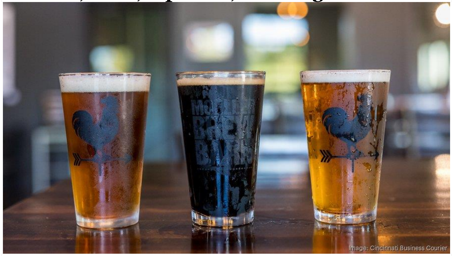
Moeller Beer Barn offers beers that aim to be slightly different than what patrons can find at other establishments.

Moeller Brew Barn craft brewery closes Monroe, Ohio, taproom, Building for sale