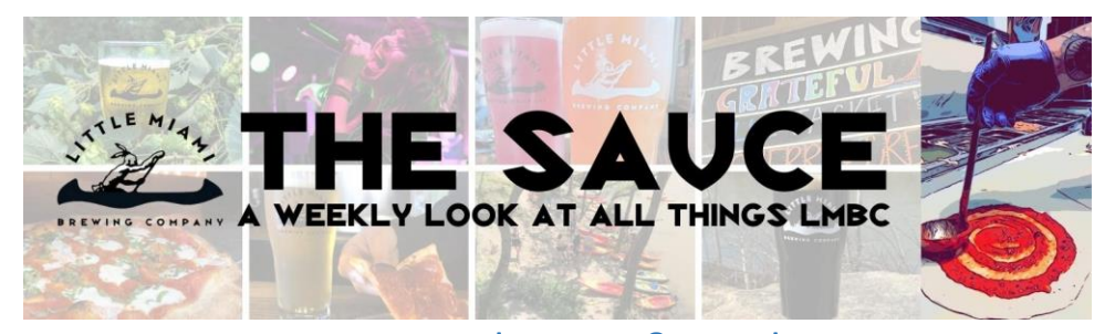
Featured Brews & Food