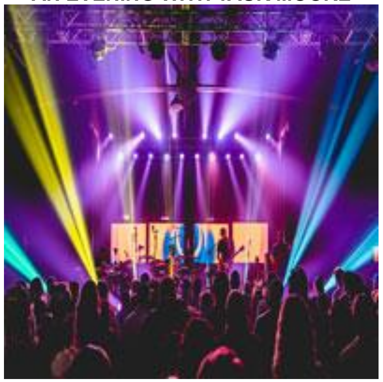
"PAINTING WITH SOUND"