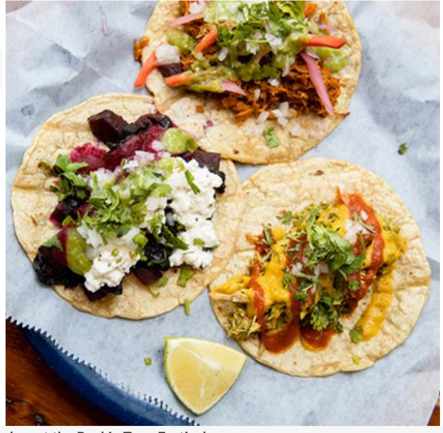
Mazunte is one of the vendors at the Rockin Taco Festival.

Take in the view of the Cincinnati skyline during this culture-packed weekend filled with Mexican food, family activities, music, vendors, and your choice of margaritas, ice-cold Moerlein beers, Ole Smoky Moonshine frozen drinks or nonalcoholic beverages.