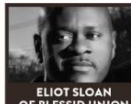
ELIOT SLOAN OF BLESSID UNION OF SOULS