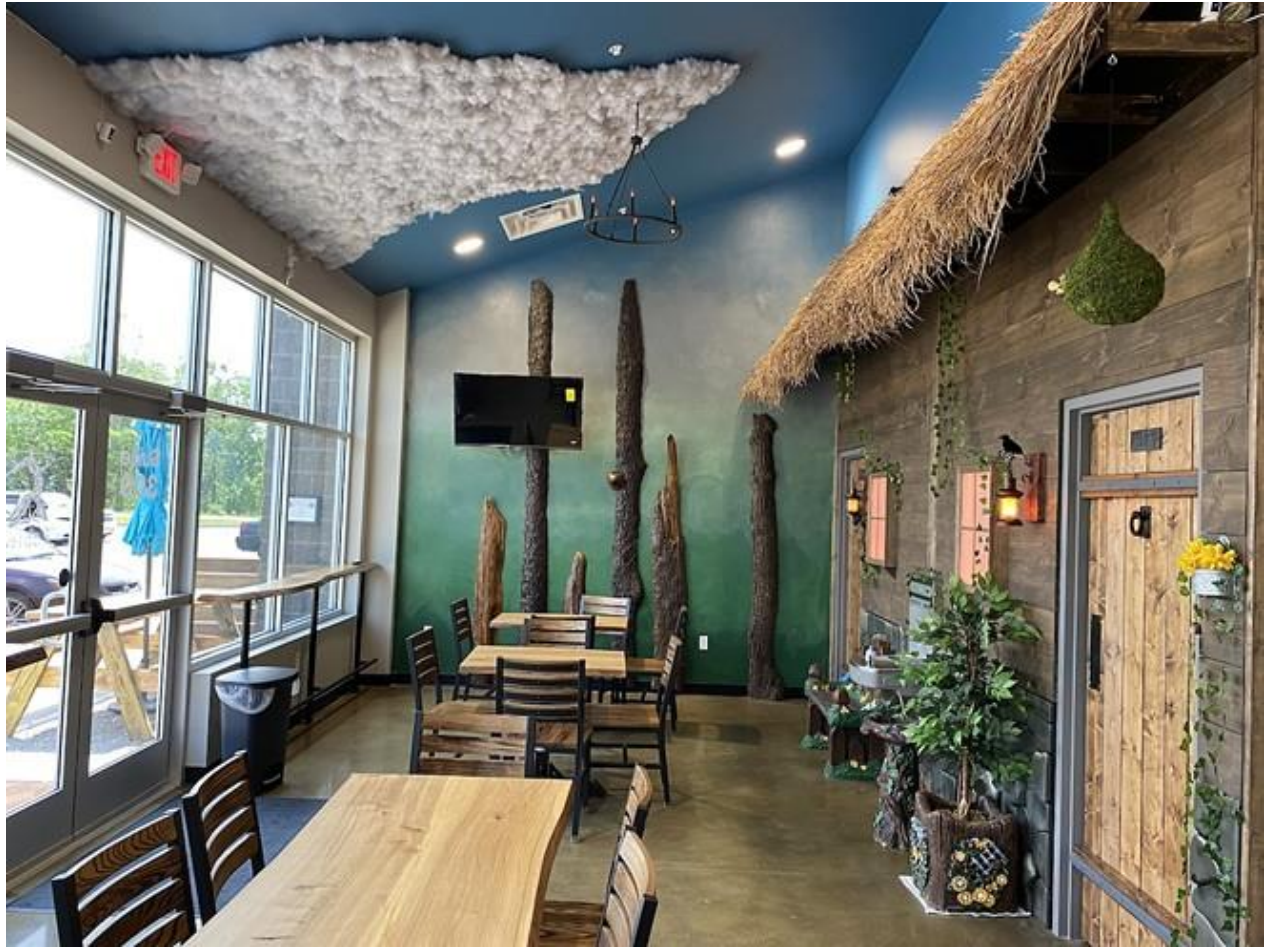
Fabled Brew Works