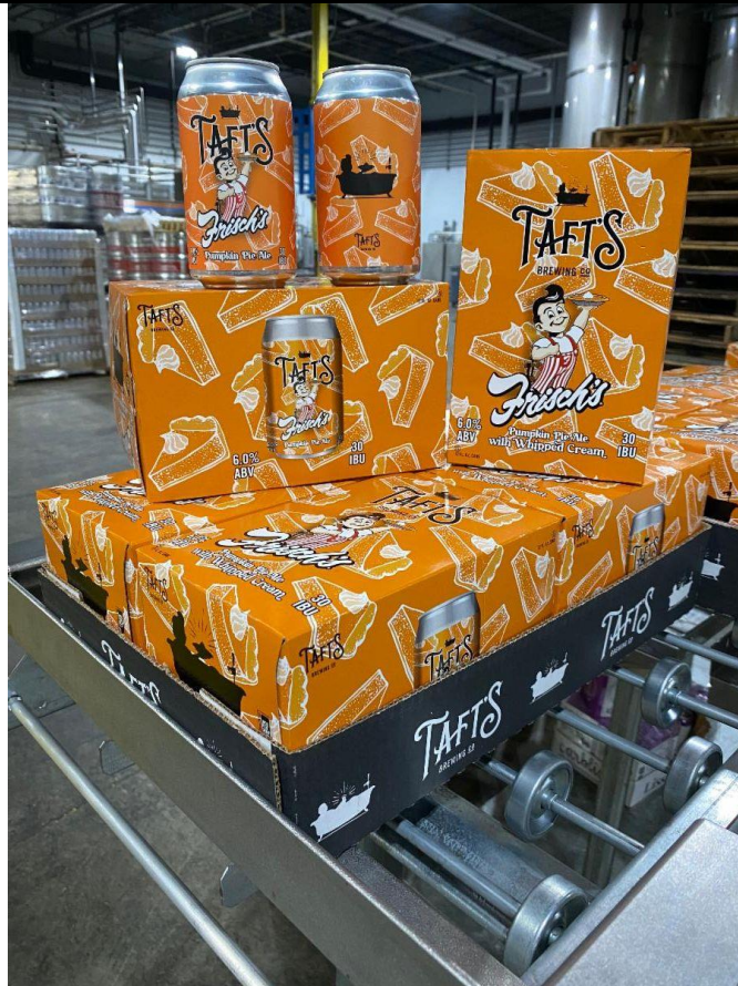
Frisch's Pumpkin Pie Ale with Whipped Cream