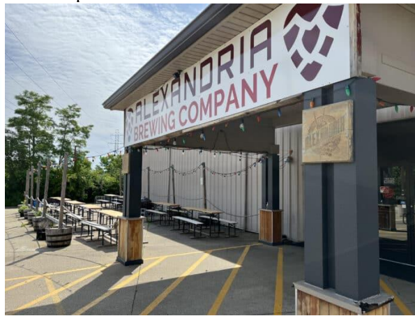
Alexandria Brewing Co.