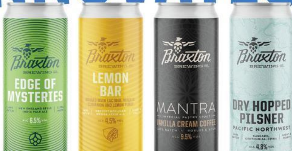
Braxton Labs unveiled a new look for its line of innovative beers.