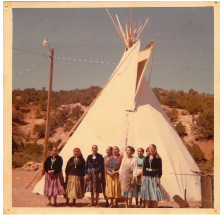
My "grandmothers" to my rights, after an all-night peyote ceremony, part of the Native American Church where many miracles took place.