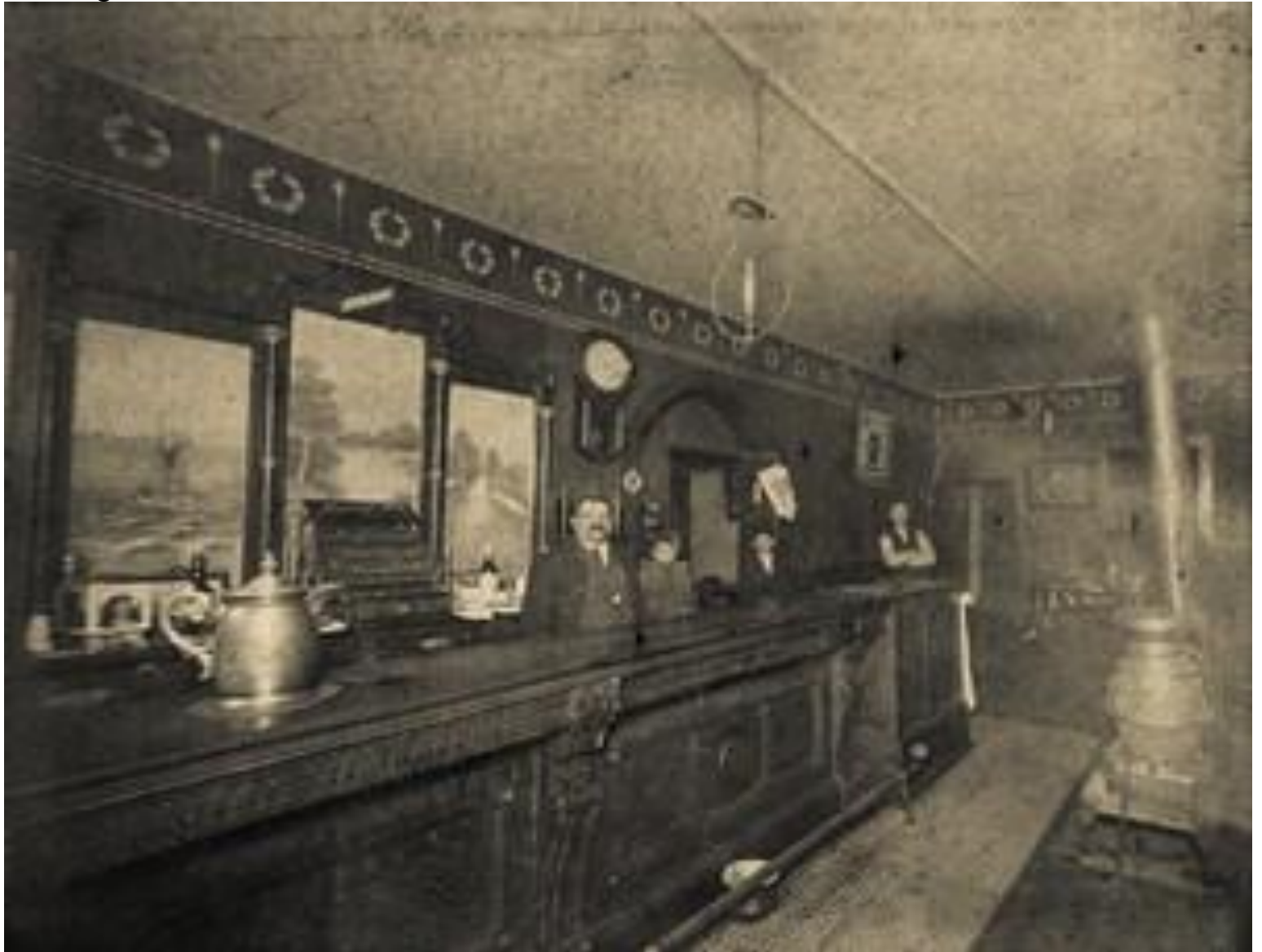
A historic photo of Arnold's.

Cincinnati was settled in 1788, so it makes sense we have quite the collection of historic drinking establishments.