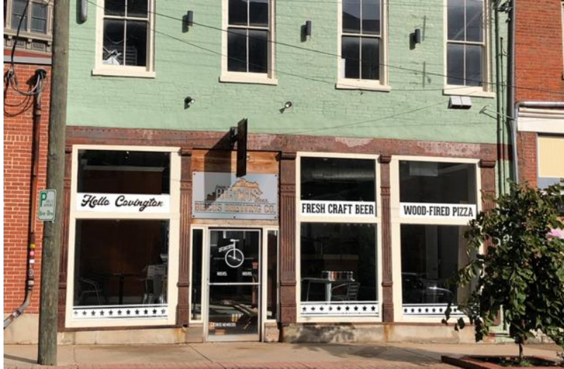
A rendering of the forthcoming Bircus taproom and North South Baking Co. bakery in Covington

North South Baking Co. will sling pastries during the day, while Bircus takes over the building at night to pour beer and serve pizza. MAIJA ZUMMO NOV 1, 2021