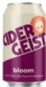
BLOOM Hard Cider 5% ABV