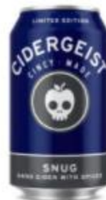
SNUG Hard Cider 5% ABV