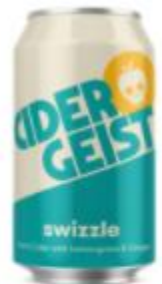
SWIZZLE Hard Cider 5% ABV