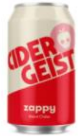
ZAPPY Hard Cider 5% ABV