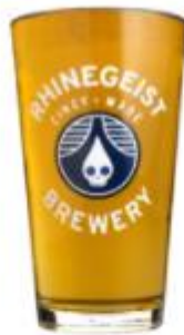
ELDERFLOWER Pear Cider 5.5% ABV