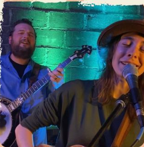
PICKIN'PEAR 07.02 | 7-10PM | NO COVER