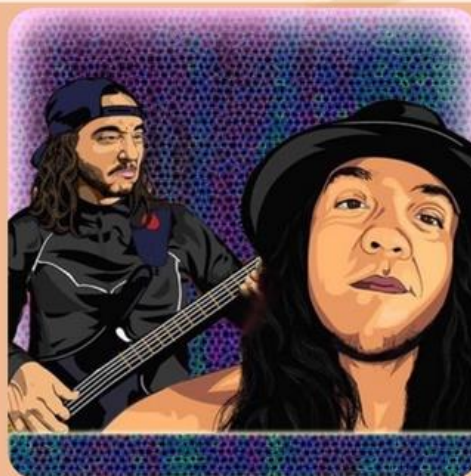
MOJO OCHO 07.10 | 6:30-9:30PM | NO COVER