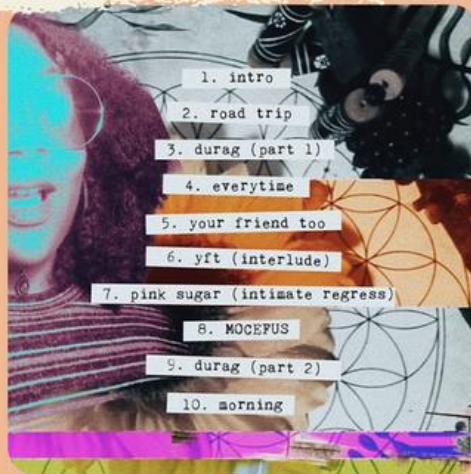
FREEDOM NICOLE MOORE & THE ELECTRIC MOON 07.03 | 7-10PM | NO COVER