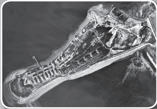
Aerial view of the former Fort Standish, Lovells Island, 1944