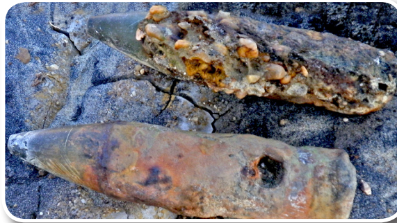
Example of large caliber munitions

Because explosive hazards associated with military munitions from past military activities may remain in the waters and land areas of Boston Harbor and Massachusetts Bay, the U.S. Army Corps of Engineers recommends that the water body manager, landowners and visitors follow the 3Rs of Explosives Safety – Recognize, Retreat and Report.